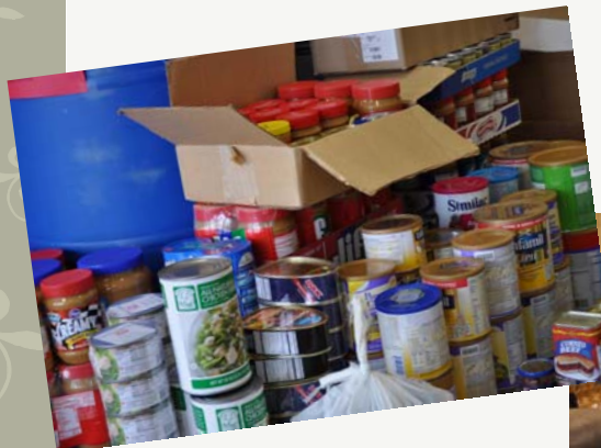
Above: Items collected for Life-line Christian Mission to use for Haiti relief.